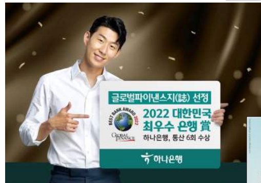
Son Heung-Min, Forward, Tottenham Hotspur