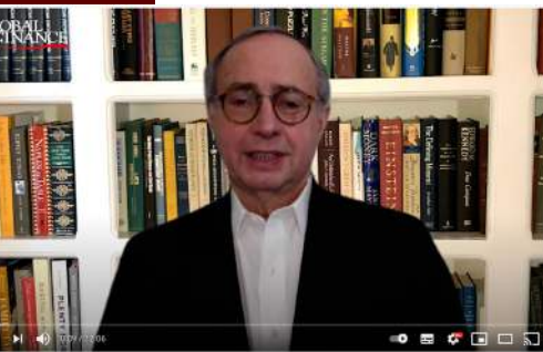
of China Award Announcement

All contact information is required for entries to be considered.